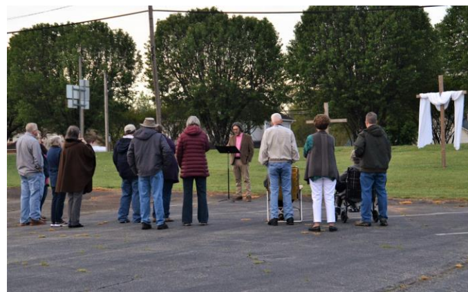
Easter Sunrise 2022