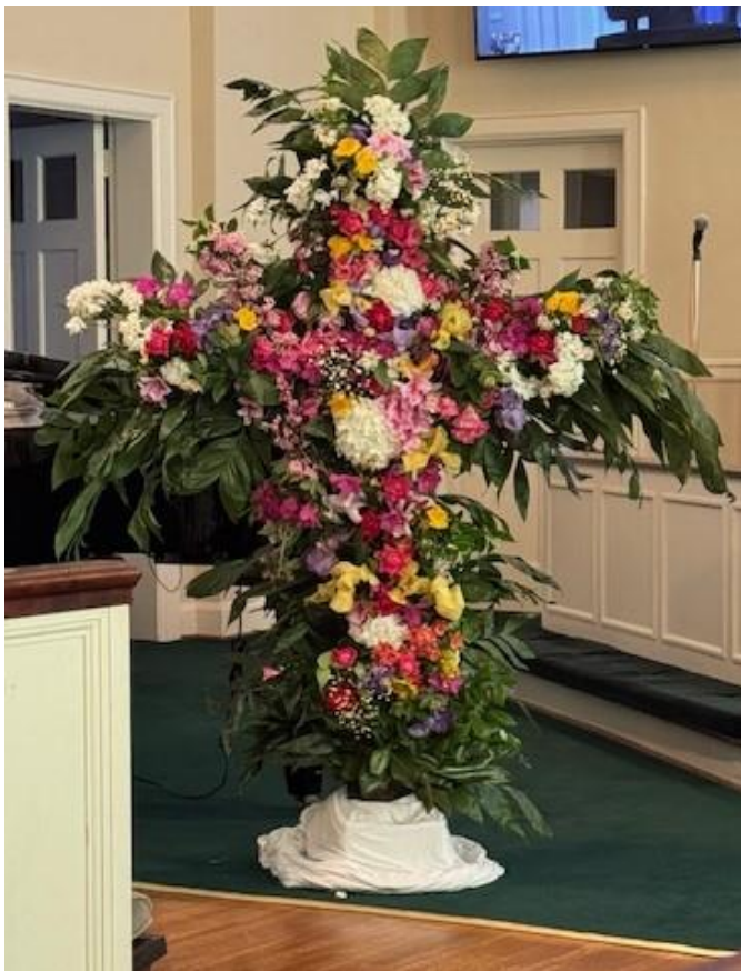
Cross of Flowers – Easter 2025

We are collecting Canned Tuna for Yokefellow. You may also make a monetary donation.