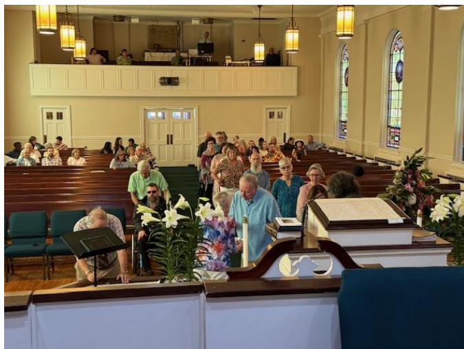
Easter Sunday 2025